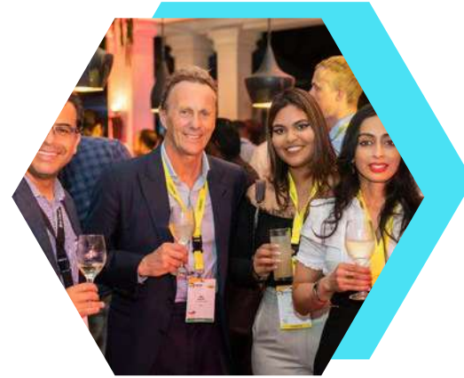
Host a Networking Event

Highlight the presence of your company at an event by showcasing your brand in a high-traffic location and making your brand a destination with a sponsored lounge, bar, b2b meeting room, or custom created area on the event floor.