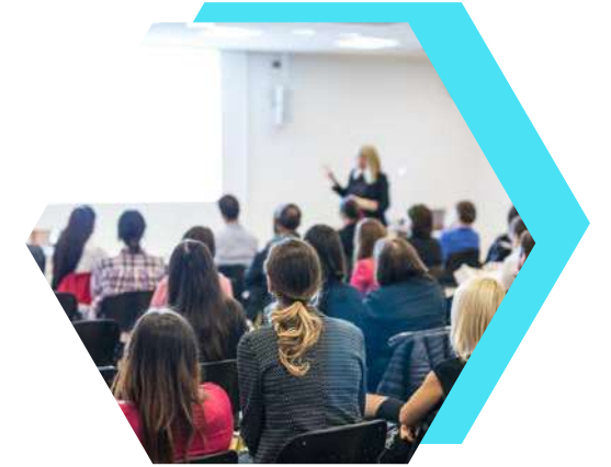
Give a Workshop

Get featured in our pre-, during-, and post event media program which consists of infomercials, social media content, our website, backdrop banners, and more. During the event, we have a special 'Daily Highlight series to direct the spotlight on your brand!