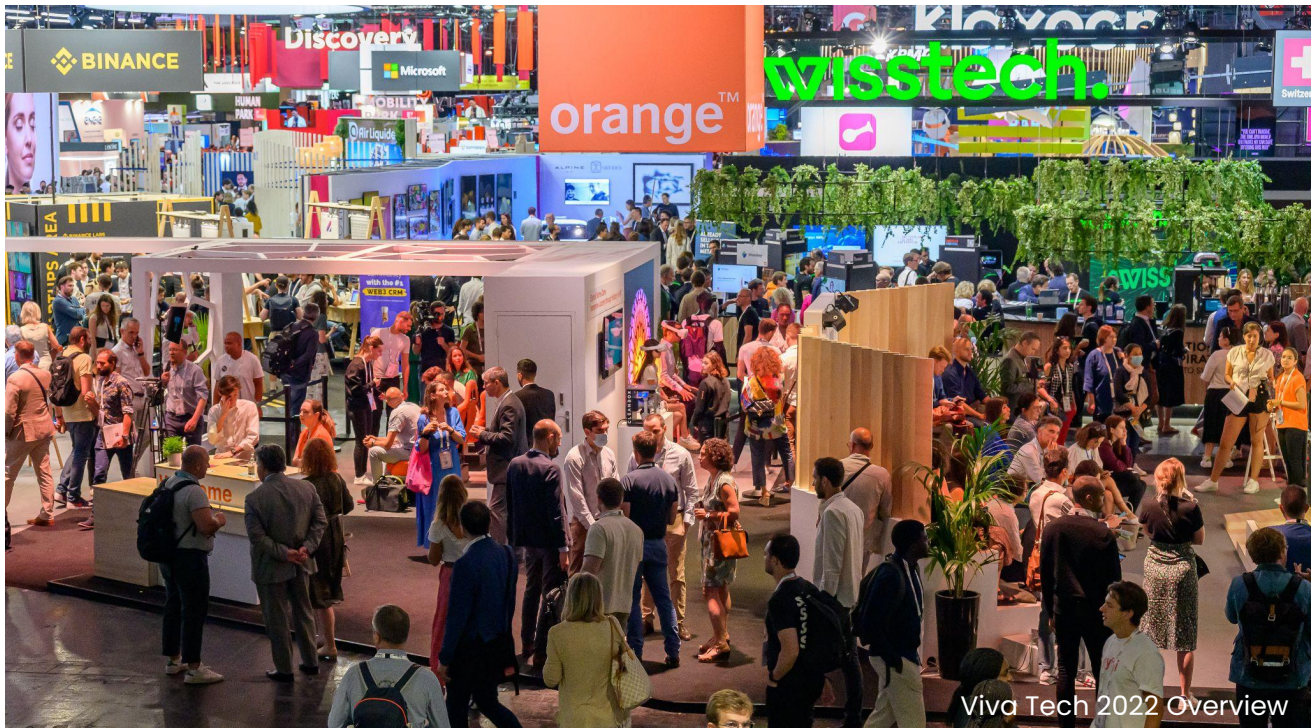
Viva Tech 2022 Overview