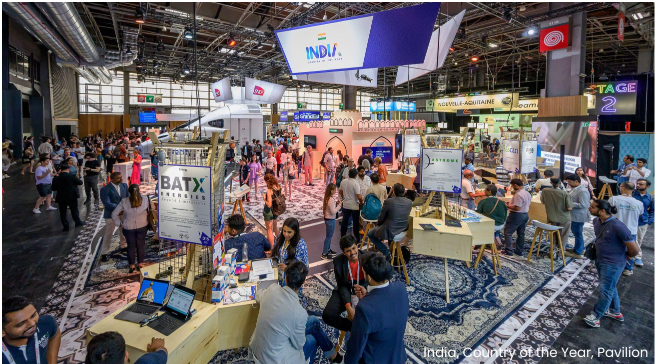
India, Country of the Year, Pavilion