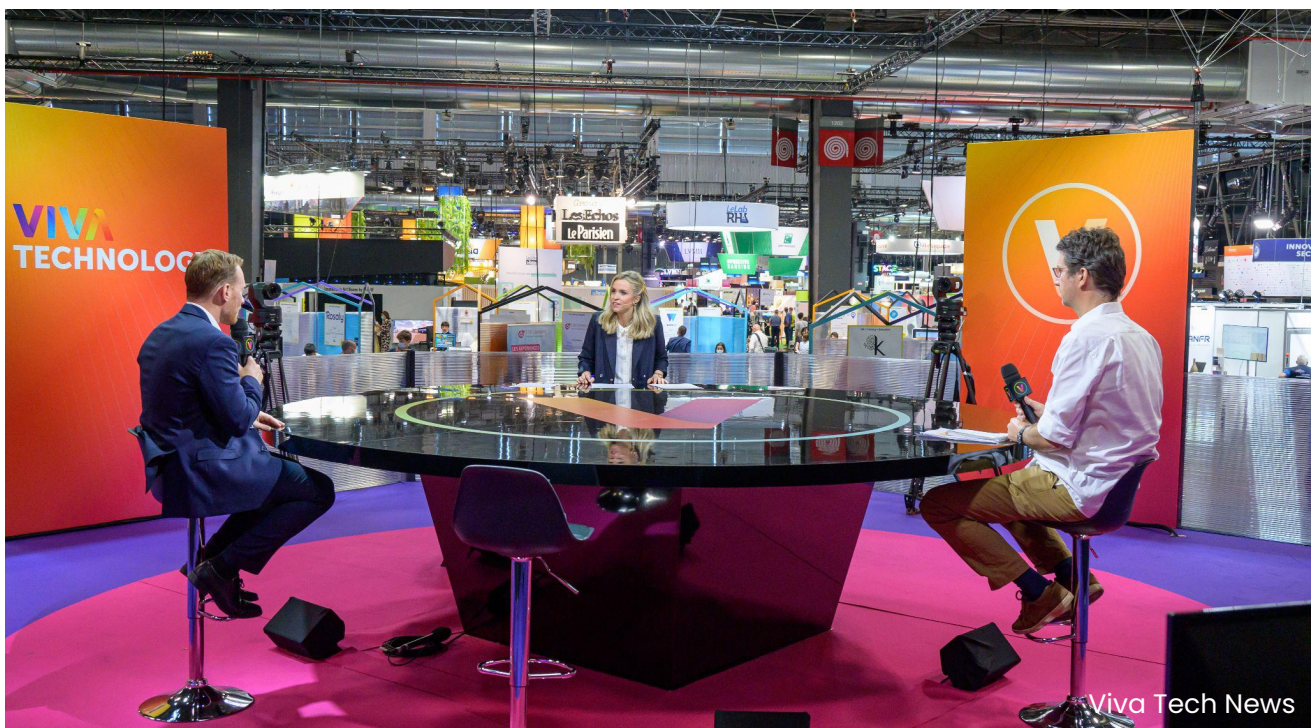
Viva Tech News