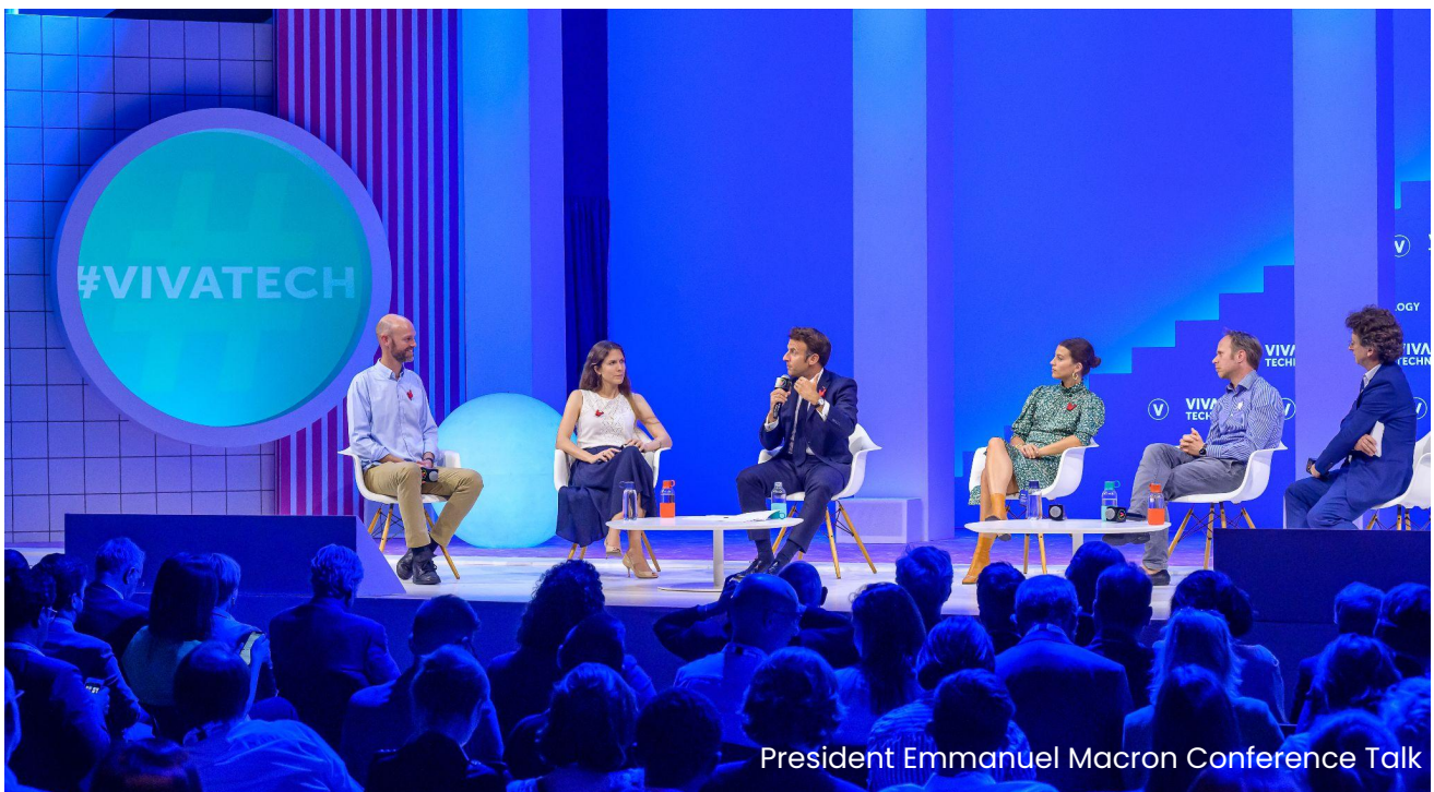
President Emmanuel Macron Conference Talk