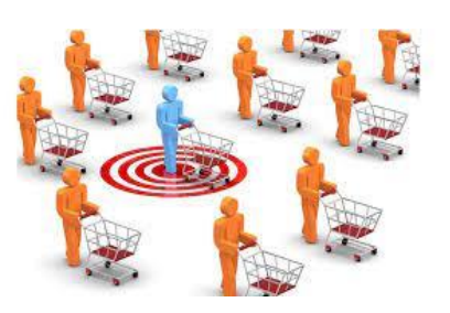
Huge Consumer base

India is leading in the production of agricultural, horticulture produce and are surplus meat producers