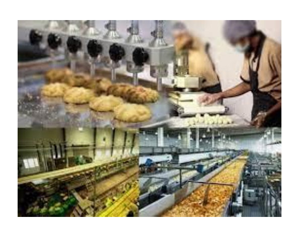
2. Strategic Segments - Unlocking Potentials for Growth