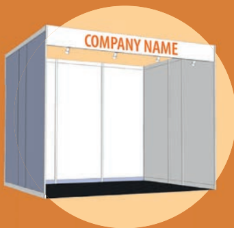
STAND SET UP minimum size 4x4

Inclusive of dividing walls, lighting, power socket and sign with company name.