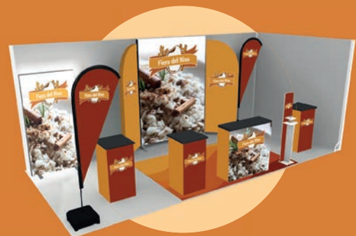
BRANDED STAND KIT BASE - MEDIUM - PLUS

Inclusive of dividing walls, lighting, power socket and sign with company name.