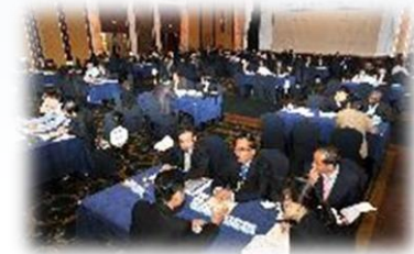
1:1 Project Meeting