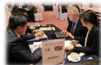
1:1 Project Meeting