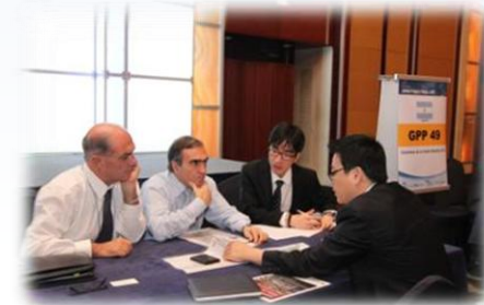
1:1 Project Meeting