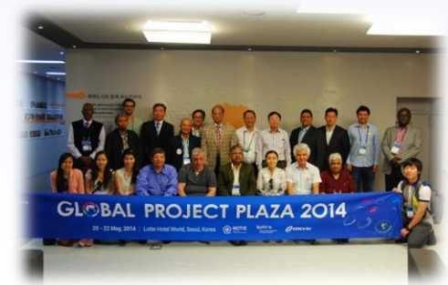
Industrial/Culture Site Tour 9