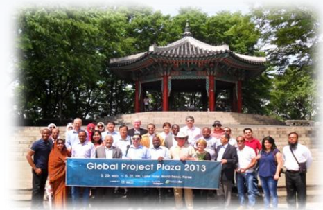
Industrial/Culture Site Tour 8