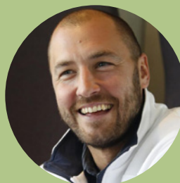
Marko Milić Former professional basketball player 1st Slovenian NBA Player and 1st man to dunk over a car