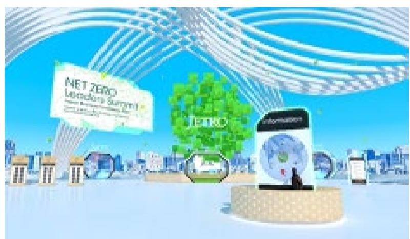
(Concept of lobby area)