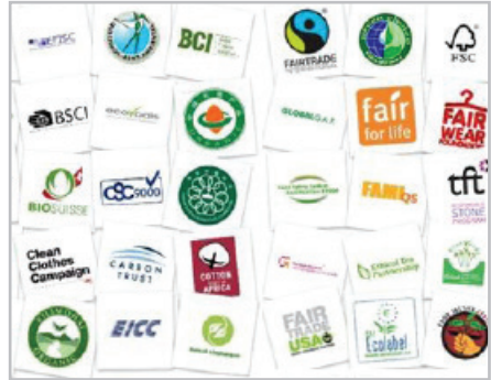
Identify voluntary sustainability standards which operate in your line of business